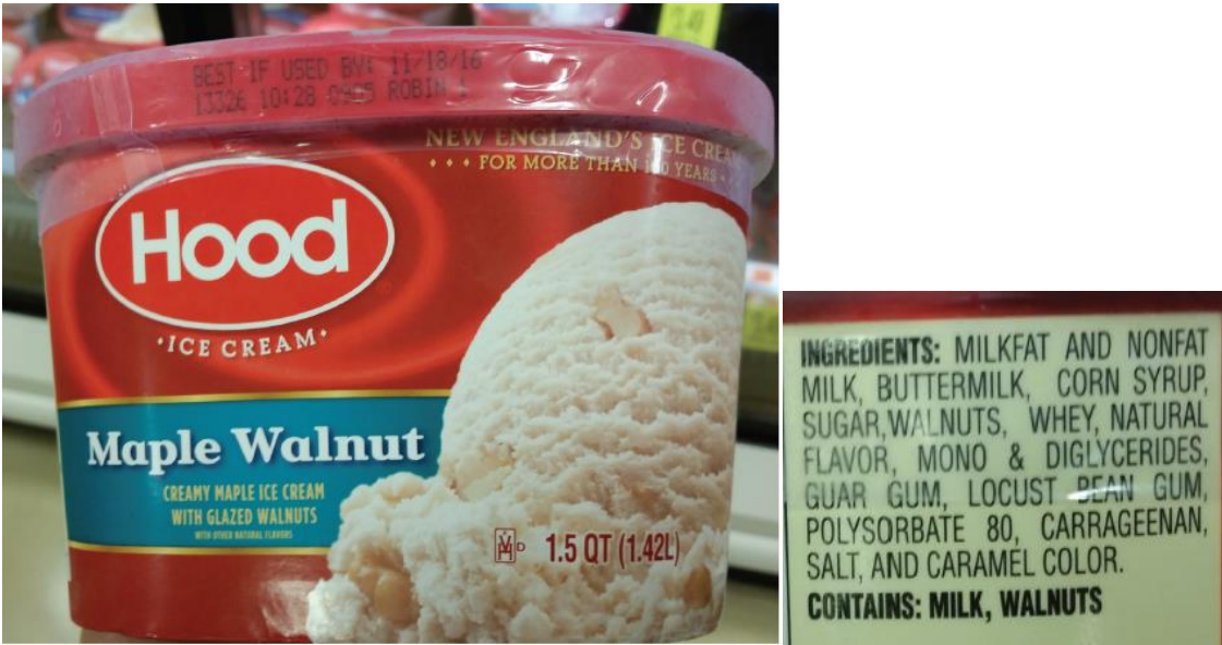
Figure 9: Hood Ice Cream Maple Walnut