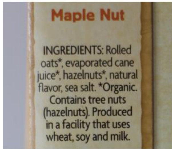
Figure 2: Nature's Path Organic Maple Nut Hot Oatmeal