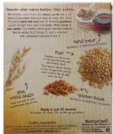
Figure 1: MOM Brands' Better Oats Maple & Brown Sugar Instant Oatmeal with Flax